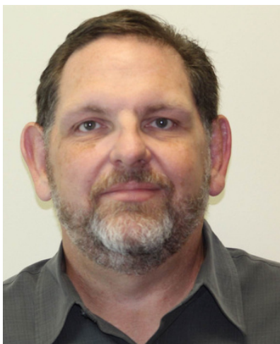
Program Manager, eGrants, Occup. Pro.