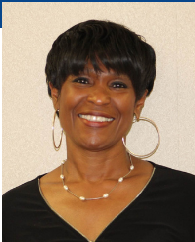
FARS Analyst I, News Support