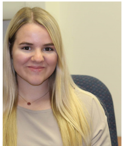
Highway Safety Office Intern