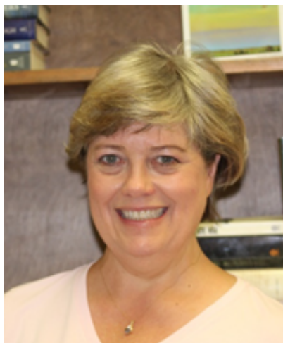
Traffic Manager, Crash Analyst, FARS SUP.