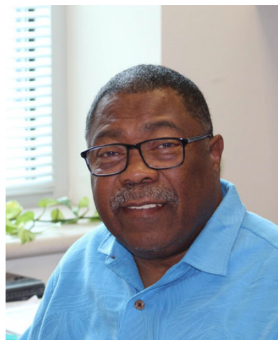
Law Enforcement Liason