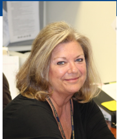
FARS Analyst, News Support