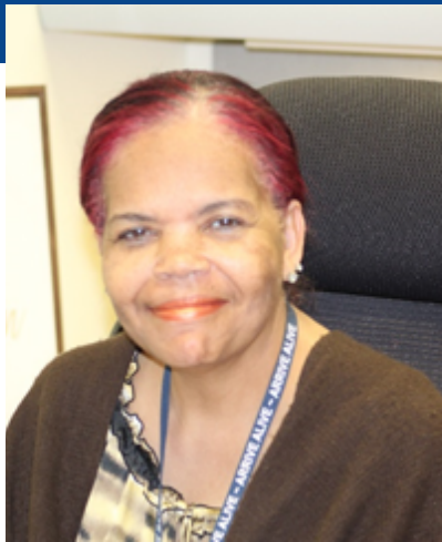
Program Manager, Public Info/Education