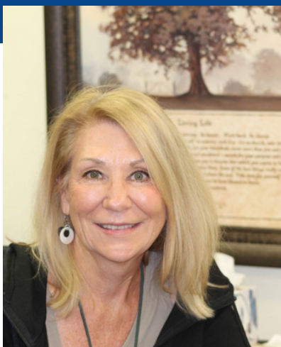
Highway Safety Office Manager