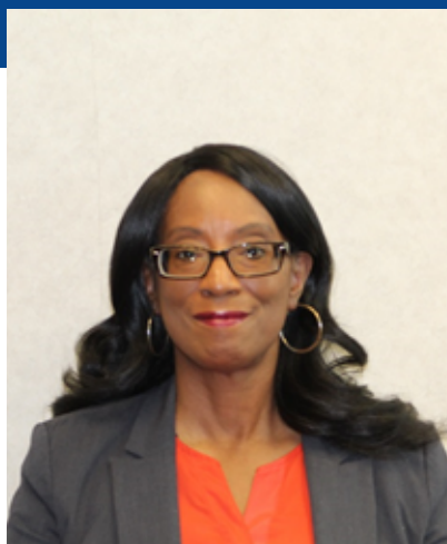
Highway Safety Administrator