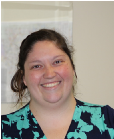
Administrative Specialist I